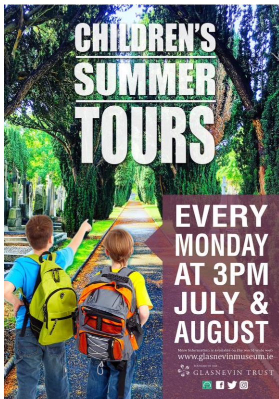
Figure 2: Email newsletter from Glasnevin cemetery

Glasnevin cemetery in Dublin is an extraordinary case in many ways. Glasnevin Trust is a non-profit cemetery management organization that took a completely innovative approach in dealing with cultural heritage at cemetery, making it a number 2 most visited tourist spot in the city.