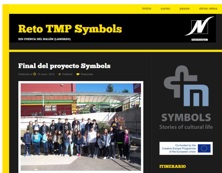
Figure 1: Website of students at Factoria Cultural

Therefore, dealing with culture aspect of cemetery is more subject to specific projects co-financed by public funds, rather than continued work. One of such projects was researching and artistic interpretation of symbols at cemeteries (Symbols project, 2018).